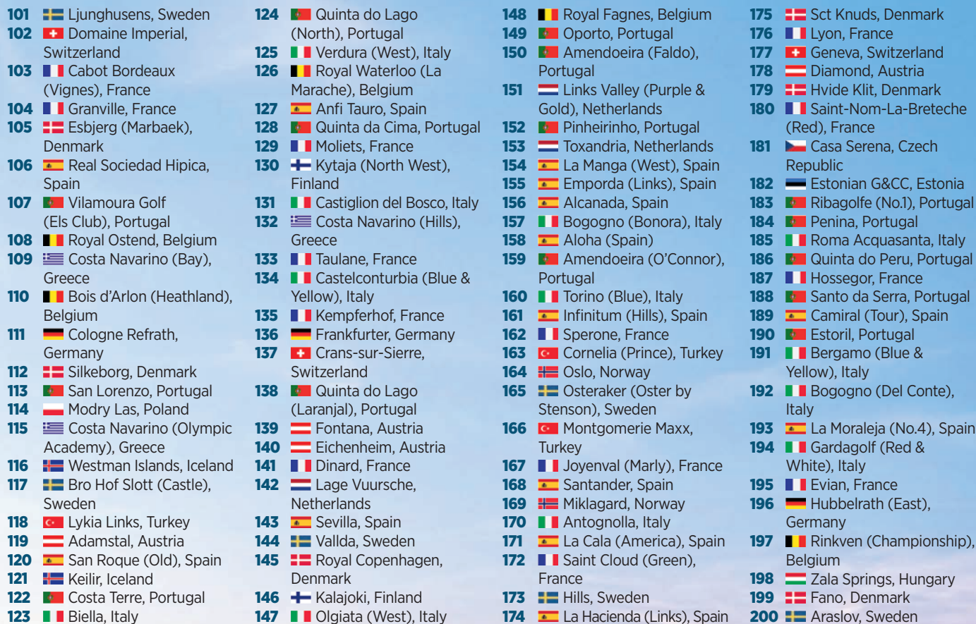
Costa Navarino (Olympic Academy)

Ranked from 101-200, and with a depth that gets stronger with every list